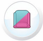
good but beware