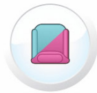
good but beware