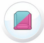
good but beware